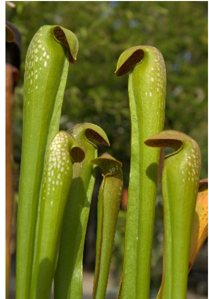
Sarracenia minor