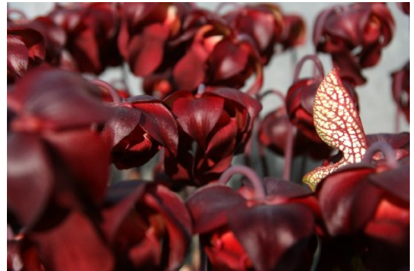
Sarracenia leucophylla

Spring is in the air! Spring is a busy time of year for everyone, perhaps none less than for the avid gardener. For those of you growing Sarracenia , your plants have been greeting the spring sun with flower buds, ever reaching for the sky on their stout stalks before finally bending their nodding flowers